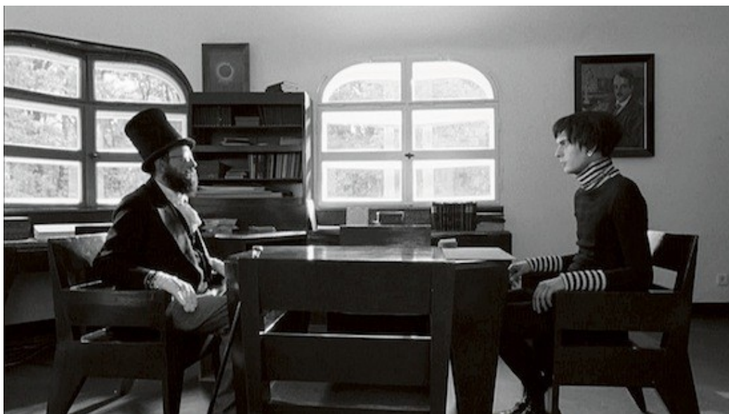
Javier Tellez, Caligari and the Sleepwalker , 2008, HD Video still.