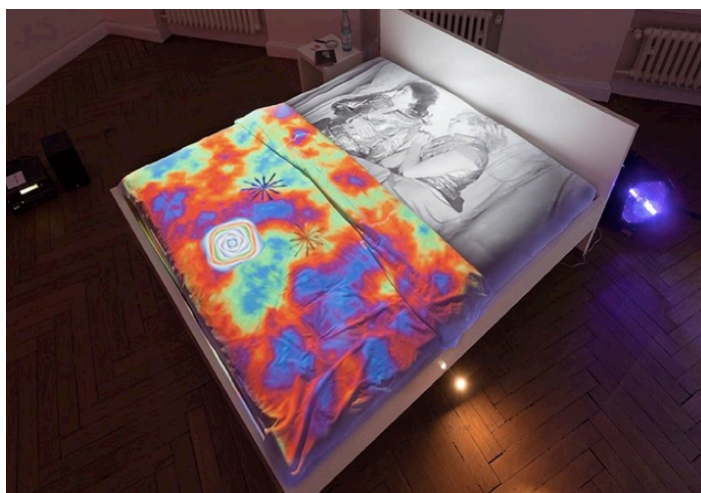
Chicks on Speed, Sleep Symphony , 2015, installation view at 401 contemporary, Berlin.